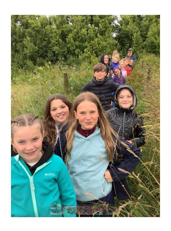
Year 6 London Residential