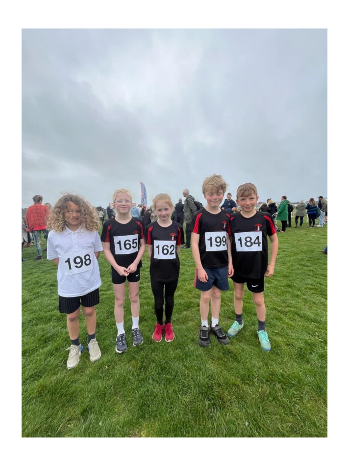
Year 5 PGL Residential