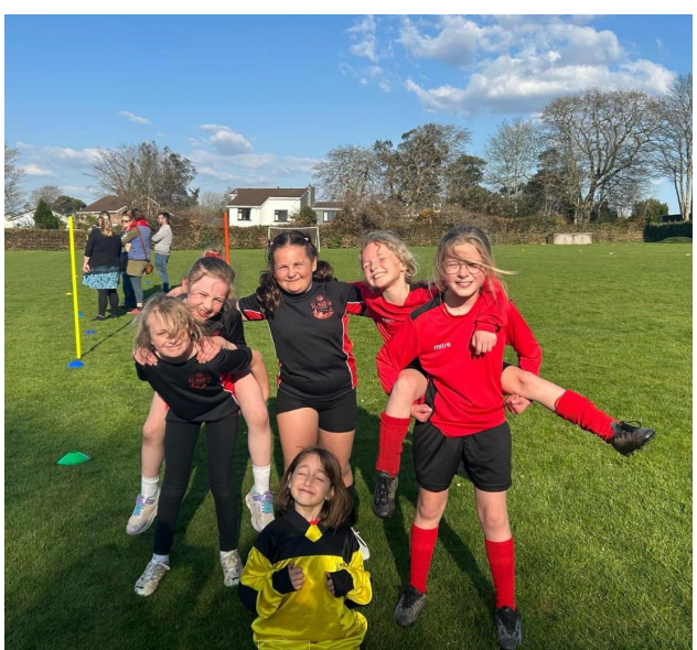
Sporting Success and Skill at St Merryn School