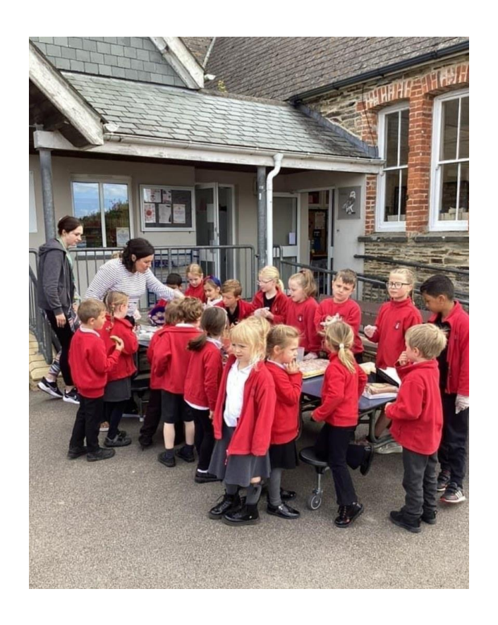
Year 6 £20 Challenge!!