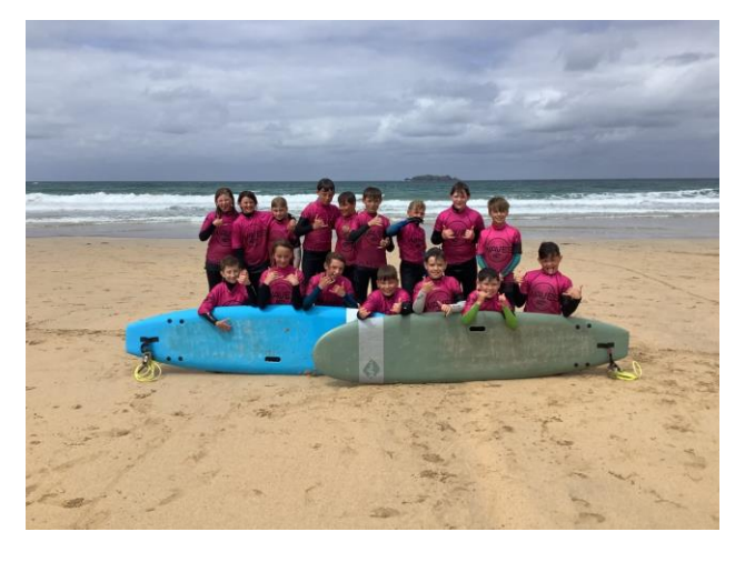
1 - We are so proud of you Year 6...What a team!